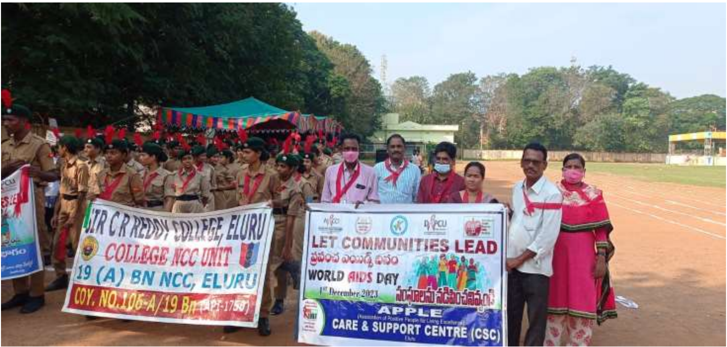
APPLE CSC STAFF PARTICIPATION