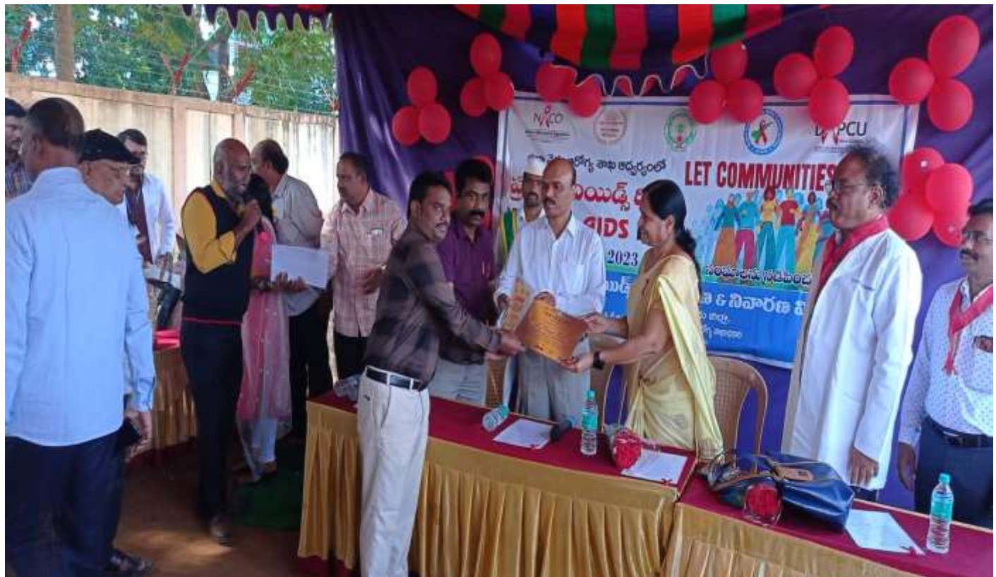
MEMENTOES DISTRIBUTED BY DLSA AND DH & HO