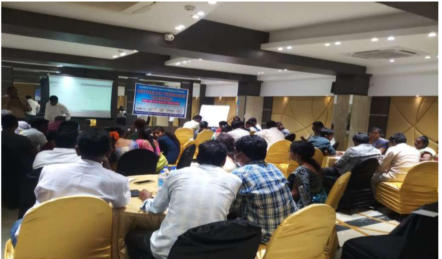
OUTREACH TRAINING IN VIJAYAWADA AS ON 29-02-2024