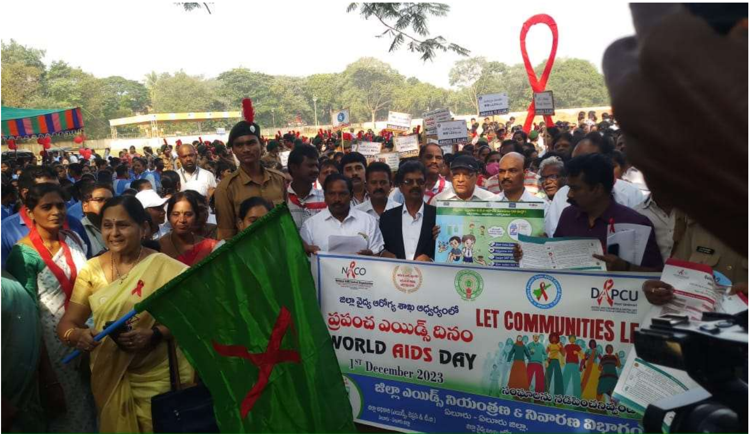
RALLY BEGAN AT STADIUM BY DH & HO MADAM