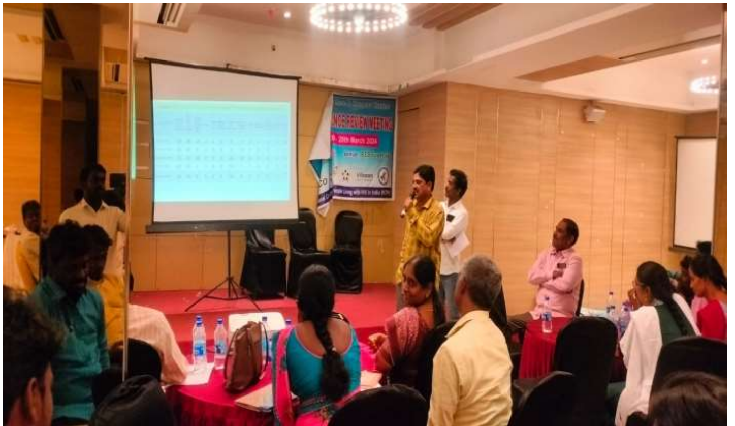
CSC REVIEW MEETING AT VIJAYAWADA ON 19 & 20-03-2024