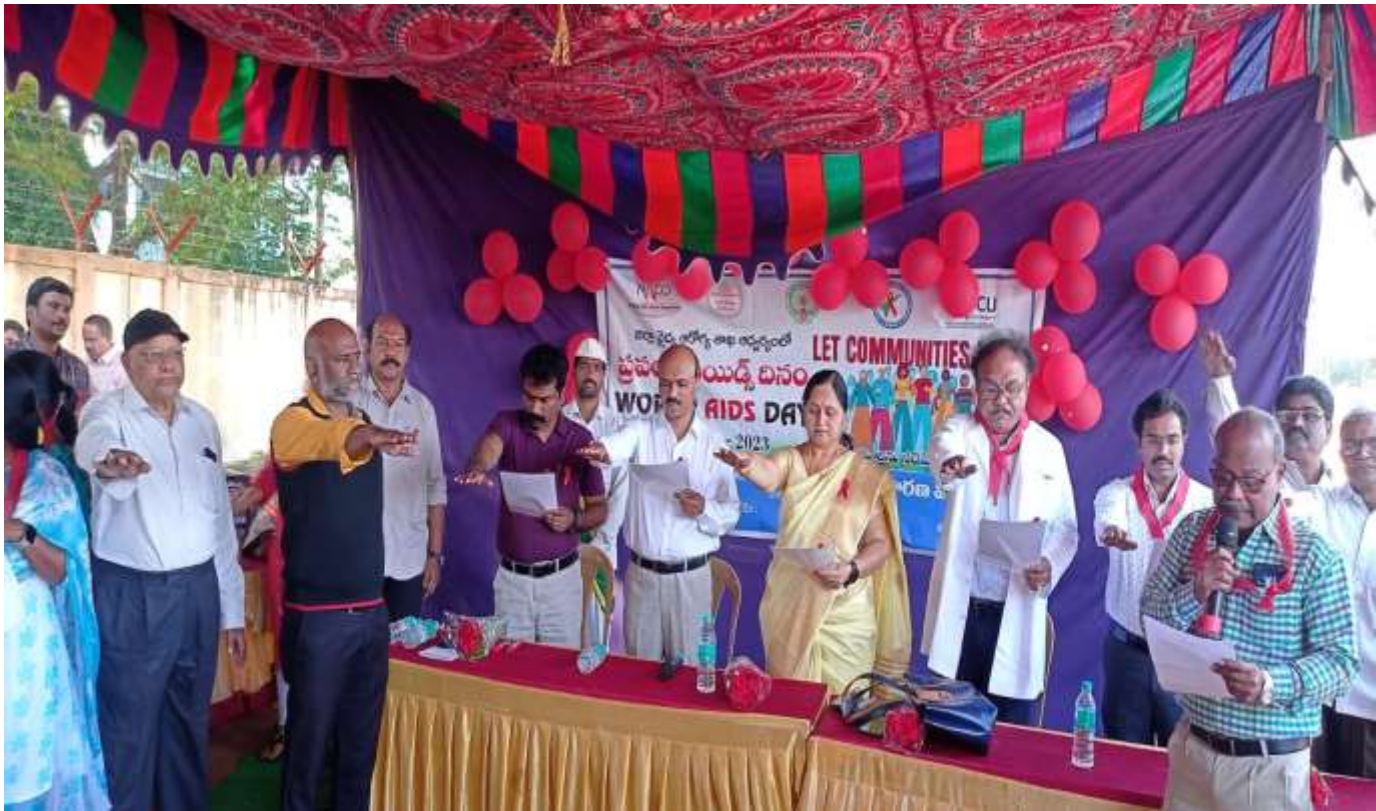
OATH AT ON STAGE BY DLSA, DM & HO, ADM & Ho, DCHS, DPM AND OTHER MEMBERS

And then we had met to all staff and put the red ribbon for all of them. They said that every year we have meet in the rally program with district officials like DM & HO Staff and other NGO's staff and also participate from some college students to bring the awareness to them with official speech. DM & HO said that during this year we have celebrate this program without any precautions like maintain social distance, wearing masks and using sanitizers. Government given pension for infected client to protect them and also giving nutrition and also supplied ART Medicine for free of cost for all clients in the state. And then rally began from Indoor to Court premises through Fire station centre with all participated members and came back to stadium. At that they had given Biscuit Packets, Bananas and Water Bottles for each participated member and then they had disbursed.