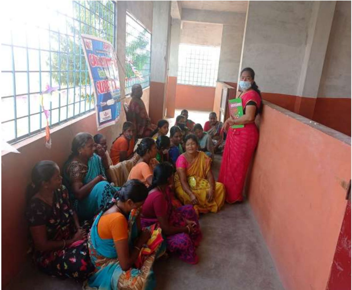
SUPPORT GROUP MEETING IN ELURU