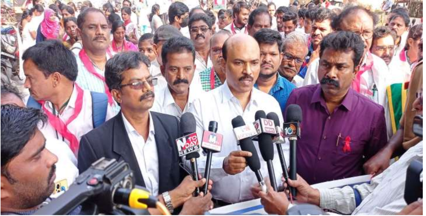
PRESS MEET AT INDOOR STADIUM