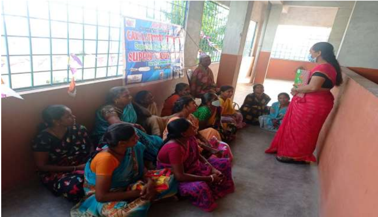
APPLE CSC ORW-01 CONDUCTED SUPPORT GROUP MEETING IN ELURU WITH CLIENTS