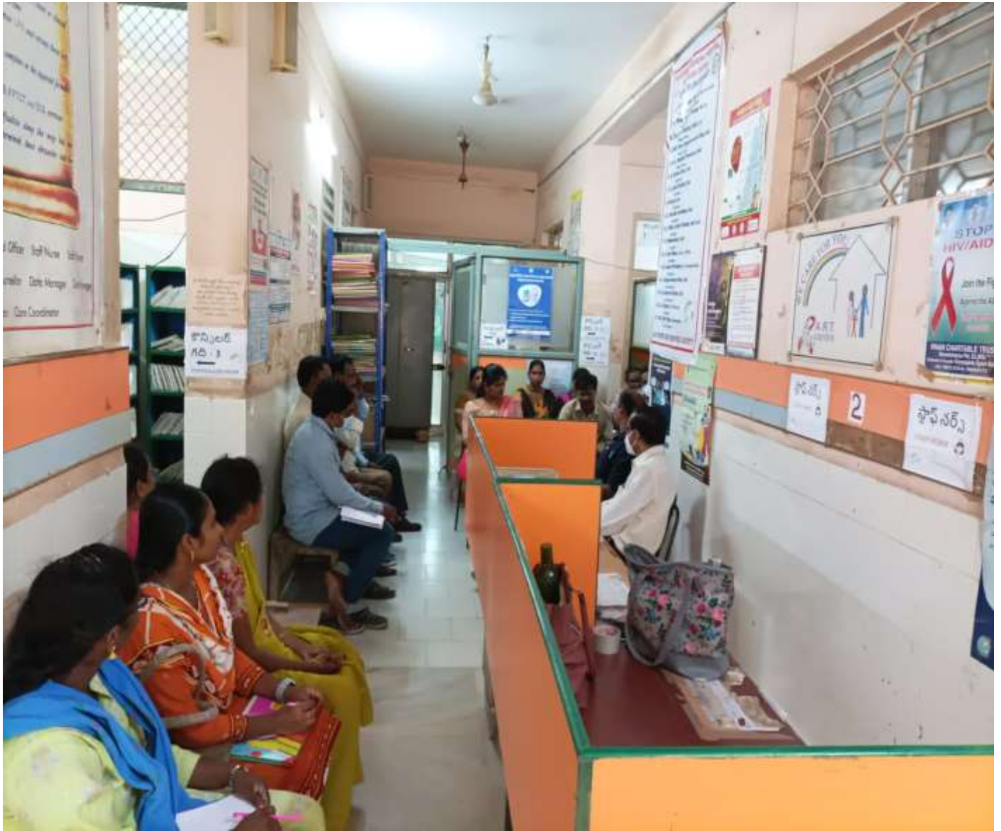
ART CSC COORDINATION MEETING IN ELURU ART CENTRE