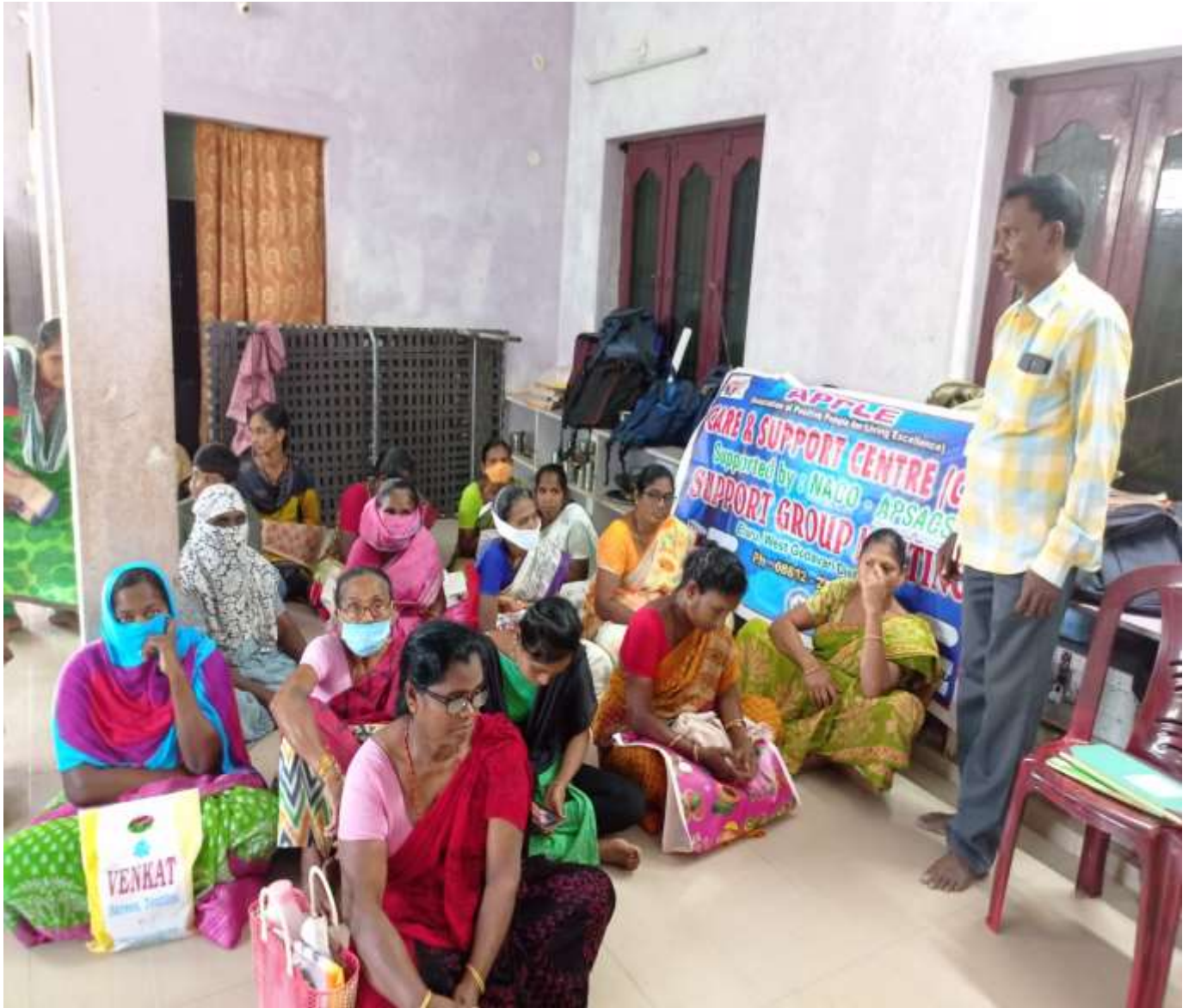
SUPPORT GROUP MEETING IN MADEPALLI