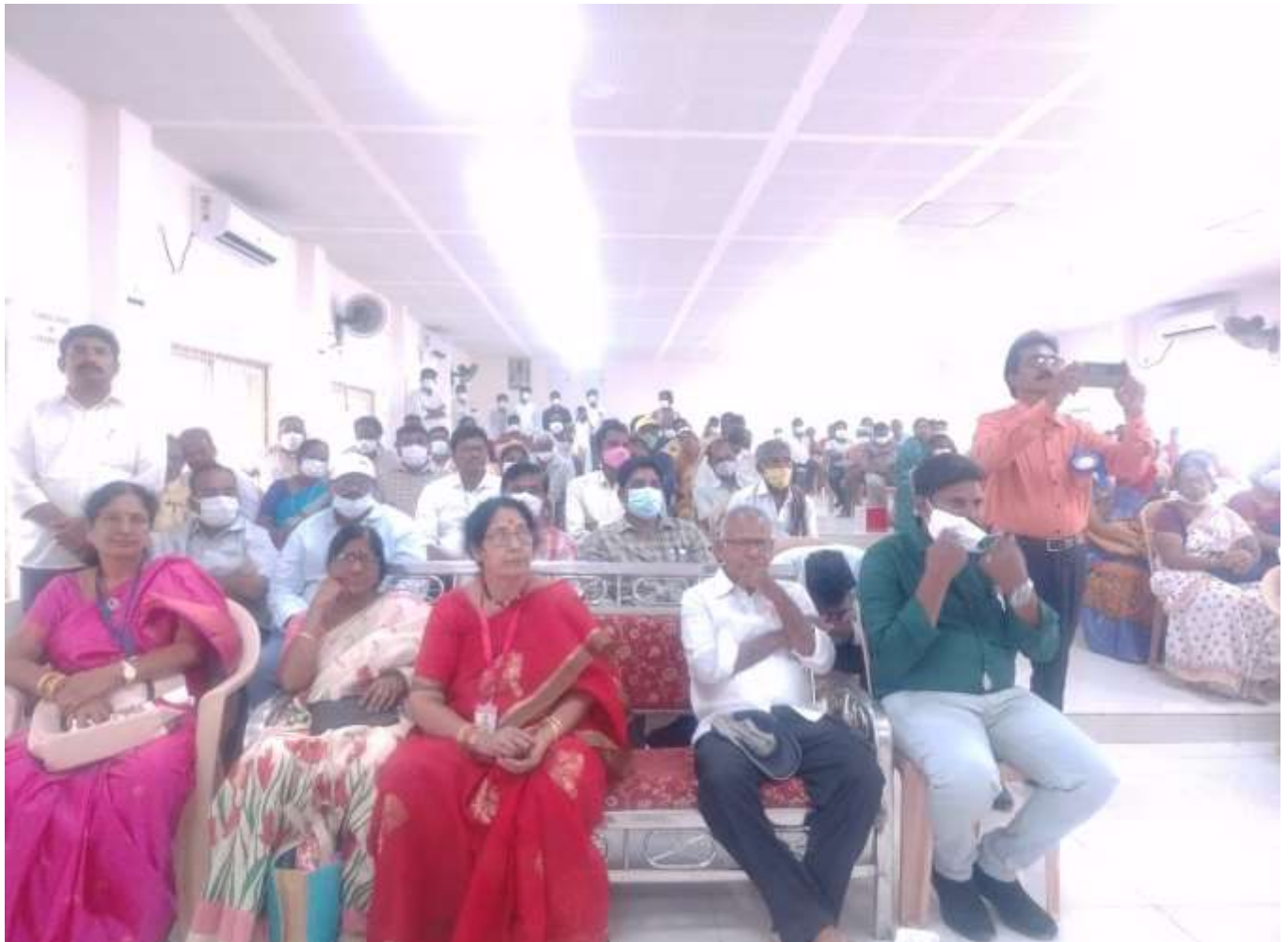
PARTICIPATED IN WORLD TB DAY PROGRAM AT GOVERNMENT MEDICAL COLLEGE, ELURU