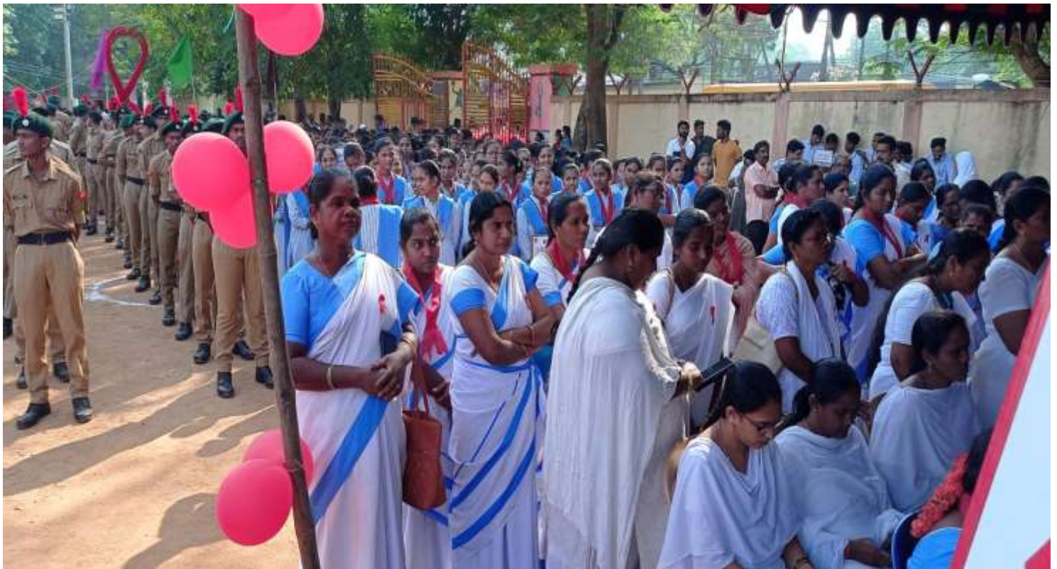
PLEDGE AT STADIUM