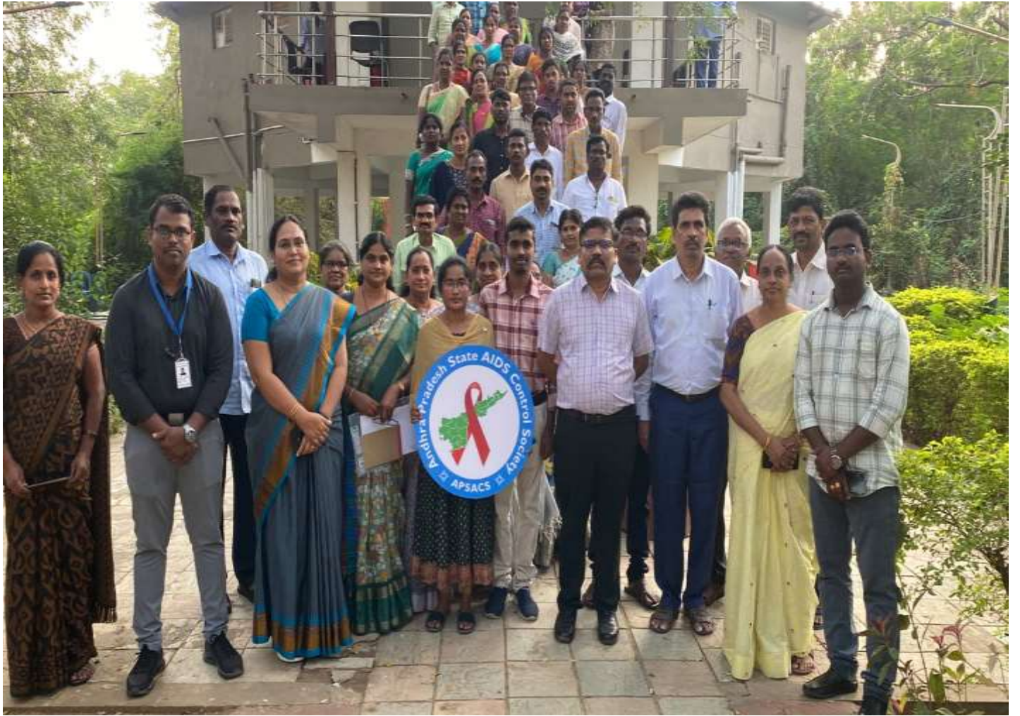
APSACS PD and Sacs staff and CSC PD's and Outreach staff at Vijayawada as on 02-02-2024.