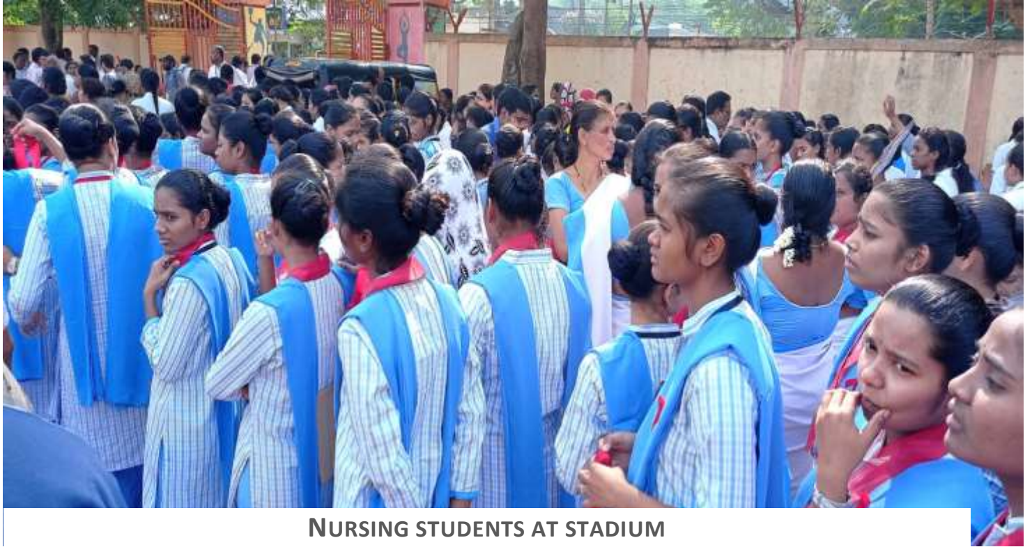
NURSING STUDENTS AT STADIUM