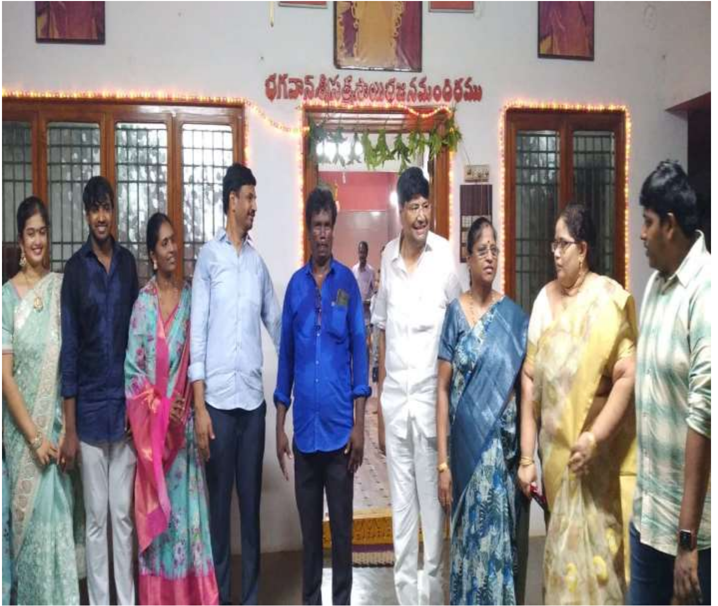
ADVOCACY MEETING IN BHIMAVARAM