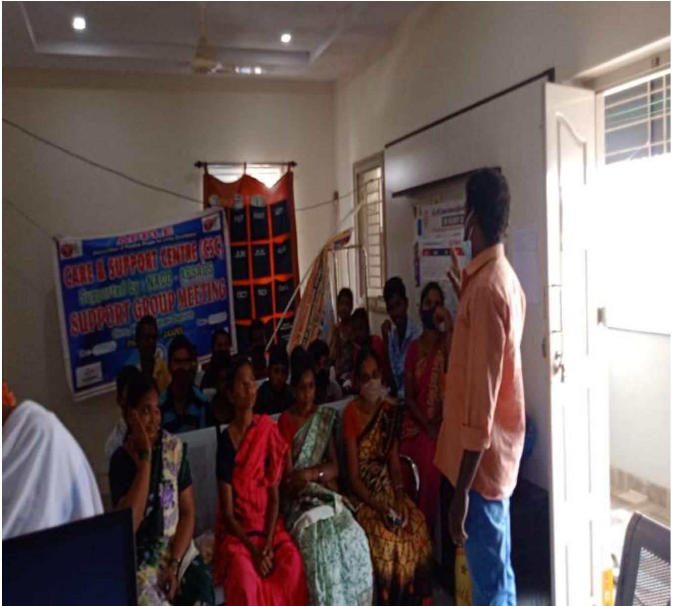
SUPPORT GROUP MEETING IN PALAKOLLU