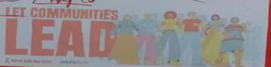
SIGN BOARD AT STADIUM