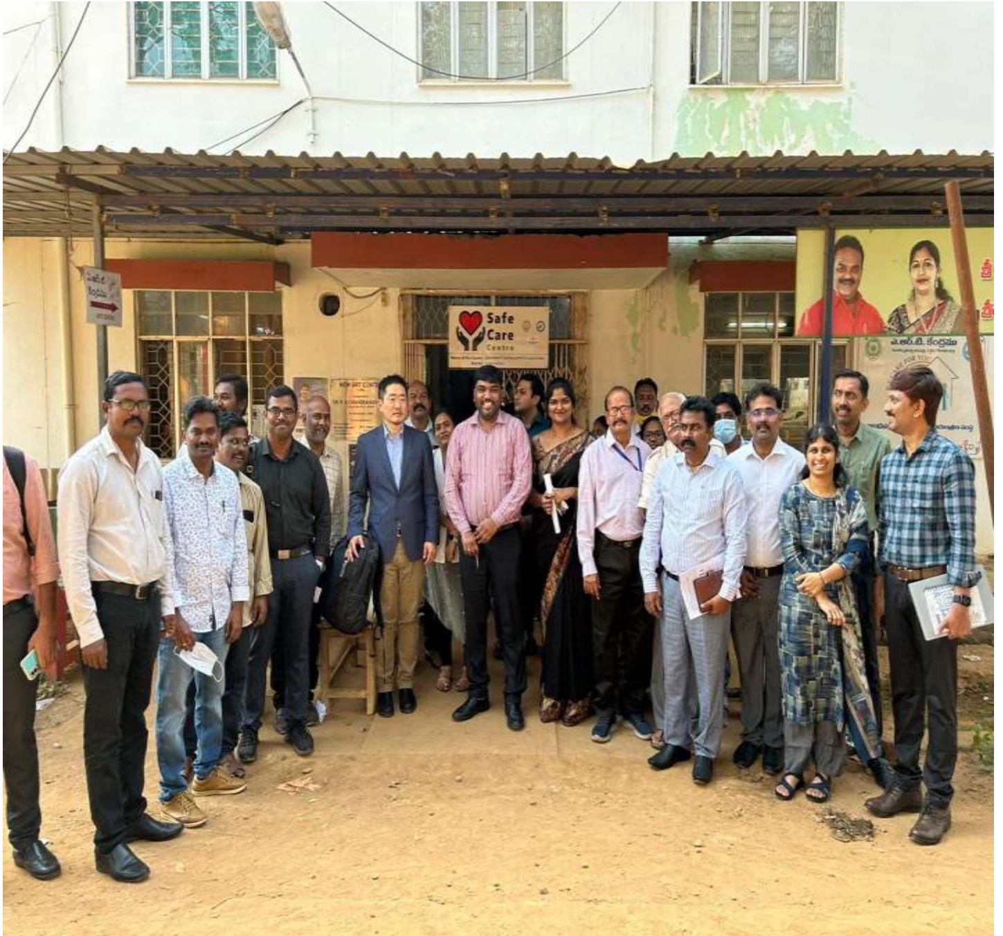
NACO TEAM VISITED TO ELURU ART CENTRE AS ON 23-01-2024