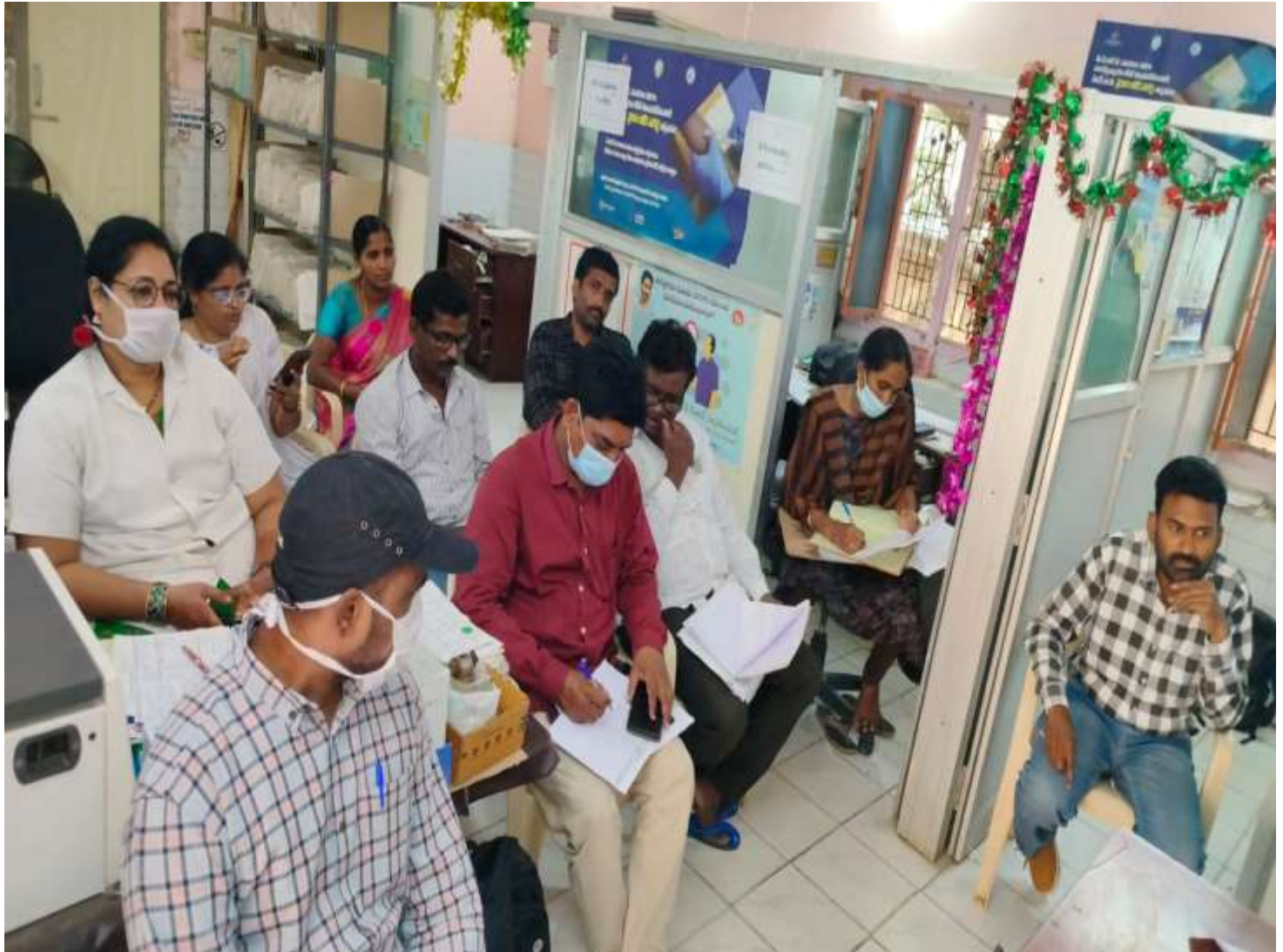
ART CSC COORDINATION MEETING AT BHIMAVARAM ART CENTRE

more cases for art. And moreover, again asking 9 kind of Priority client line list for follow up. For this month they had given CD4<200 cases and HIV-TB Co infections line list.