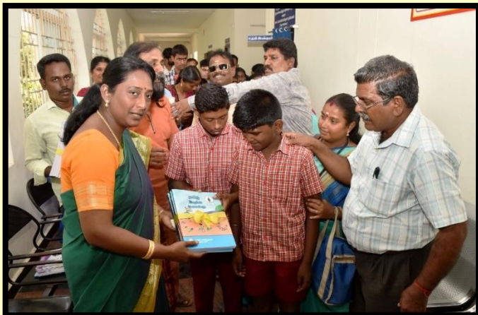
District Collector – Madurai District distributed Note Books and Tutorials to our ROYALVISION Special School Children